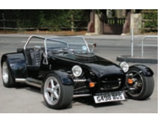
Stock also includes other hand-built cars such as the V8 powered Rush.

In 1999 Larry purchased a showroom near the village of Whitchurch, only a stonesthrow away from Basingstoke. Close to the M4 and M3, it seemed an ideal location for Sovereign Cars. The vision was to create the country's leading home for hand-built supercars. A complete refurbishment programme soon ensued and the results are simply astonishing. I defy any visitor not to be impressed. Your senses are bombarded by sight and sound as you enter the front showroom. Notice I said 'front' showroom, because if you walk through the array of