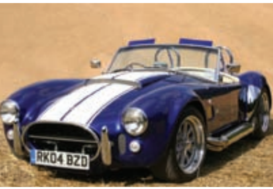
The Absolute Performance C350. A brand new turnkey car built to your colour scheme.