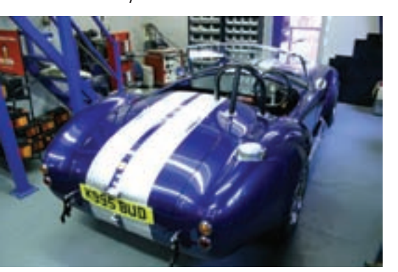
A KCC Cobra going through the workshops prior to delivery.

blue neon and gleaming cars, Larry's new masterpiece will come into view: a 2000 square feet extension, bursting at the seams with more Cobra replicas. Naturally, the blue neon theme continues as do the tunes from the Wurlitzer.